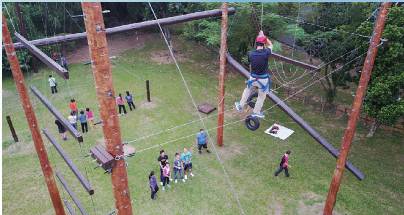
■ New Generation Physical Education Classes Going into Nature

Elementary school Physical Education classes are no longer boring. The Sports Administration has developed PE course teaching modules, with situational leading exploratory learning and with experiential methods combined with fun exploratory practice, creative thinking, and reflection action learning giving PE classes more room for imagination.