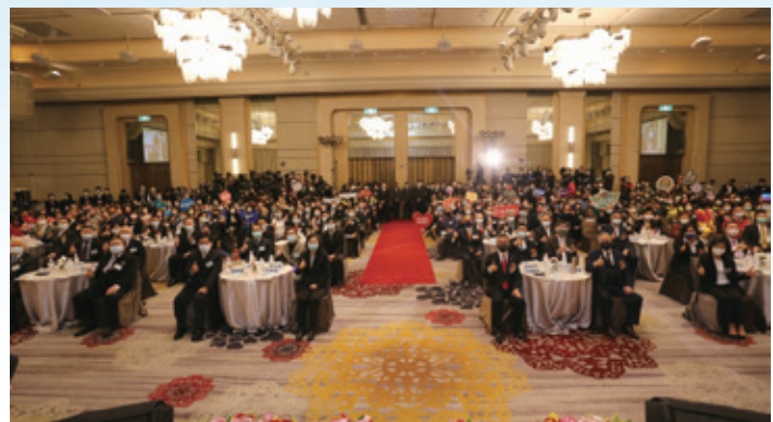
Group photo for the 12th Sports Activist Awards