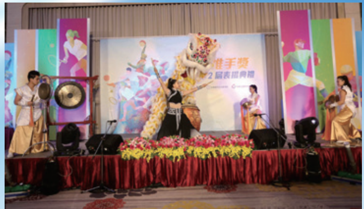
The 12 th Sports Activist Awards commendation ceremony featured a performance of Calling Up Swirling Clouds to boost the morale of athletes

During the event, President Tsai emphasized that making an outstanding athlete doesn't only depend on the hard work, perseverance and passion of the athlete, guidance of coaches, encouragement of friends and family, there is also a lot of unsung support behind the scenes that promotes sport hidden behind the applause. This means that while rewarding outstanding athletes, we should also give applause and thanks to these behind-the-scenes pushing hands. It is hoped that the Sports Activist Awards encourage everyone to be pushing hands behind Taiwan's sports development so that taking part in sports promotion becomes popular, giving sport endless support to jointly build a healthy Taiwan and show the world our pride.